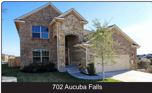
702 Aucuba Falls

$315,990 - Jester II - 2,580 Sq.Ft. 2 St / 4 Br / 3.5 Ba / 2 Lv / 2.5 Gr