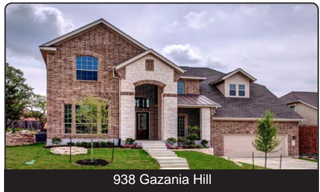
938 Gazania Hill

This Jester II plan design features a large open kitchen, granite counter tops, 42" cabinets with a built-in GE® appliance package, upgraded tile flooring, two-story family room with fireplace, and an outdoor living option with fireplace and grill. CPS Energy®, Smart Energy Builder™