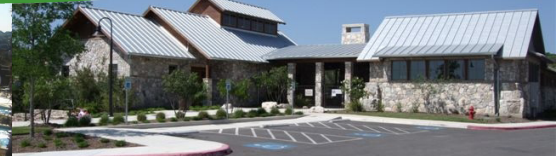
Community Pool & Clubhouse